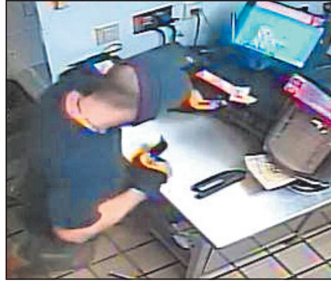
The Blairsville Police Department is looking for any tips that could lead investigators to the apprehension of the individual in this picture.