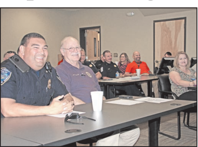
Many of Union County's finest met for the EMA Solar Eclipse Workshop on Thursday, July 20.